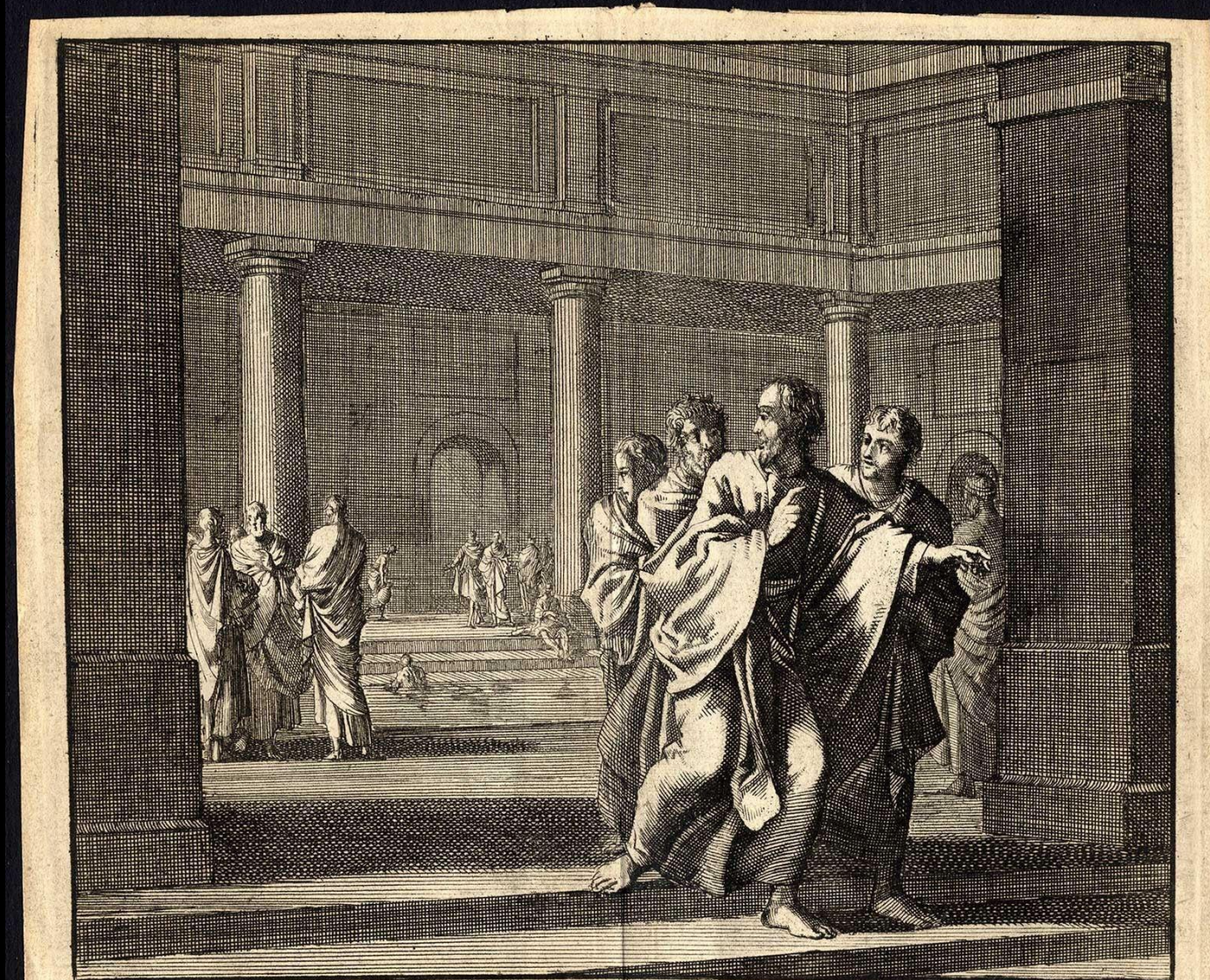
De Apostel Joannes wylt het bad loopende, om dat hy'er Cerinthus zag inkomen. 87